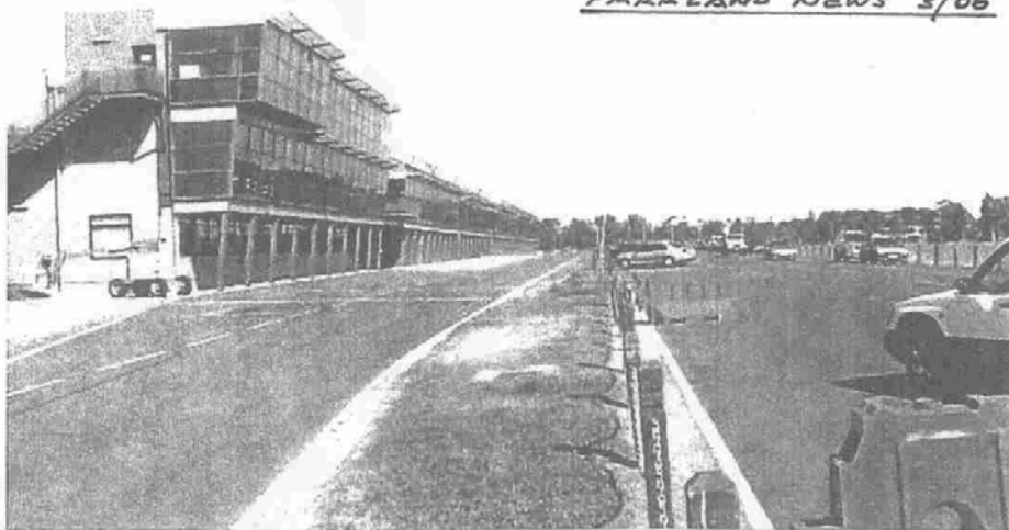
This three-storey permanent structure with expansive bitumen surrounds now 'graces' Albert Park Reserve, Melbourne because of the annual F1 race. The Adelaide multi-storey, multi-function proposal is similar, if not larger, in size.