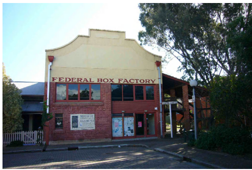
Box Factory – Soon to be renovated for community use (located at western end of McLaren Street)