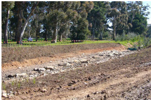
Laying back of creek banks in south eastern corner of park lands (Note campers among trees!)