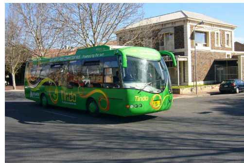
ACC “Tindo” solar powered free connector bus in Hutt Street – “A free hourly service linking key points in North Adelaide and the City”