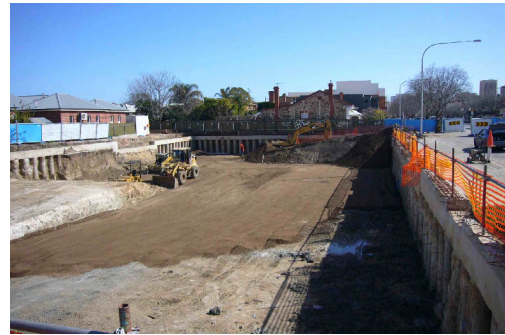
“east” apartments and penthouses development (corner of Hutt and Wakefield Streets)