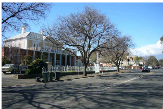
Recently sold TPI Association building (corner of Hutt Street and South Terrace)